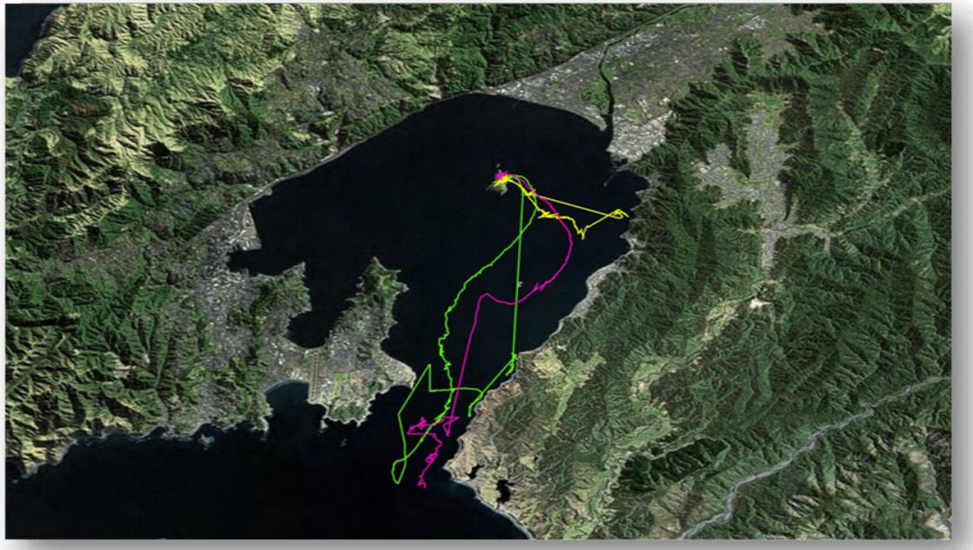
Jingjing's first GPS Tracks of three Penguin's from Matiu/Somes Island.