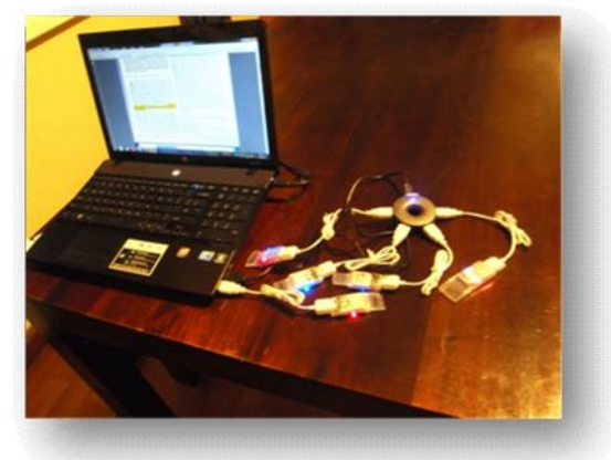
Christmas tree of lights.... GPS devices (x5) being recharged from laptop by Jingjing.